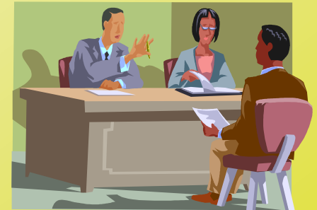
Career Management Skills

Embedded in your curriculum and demonstrated through your assignments